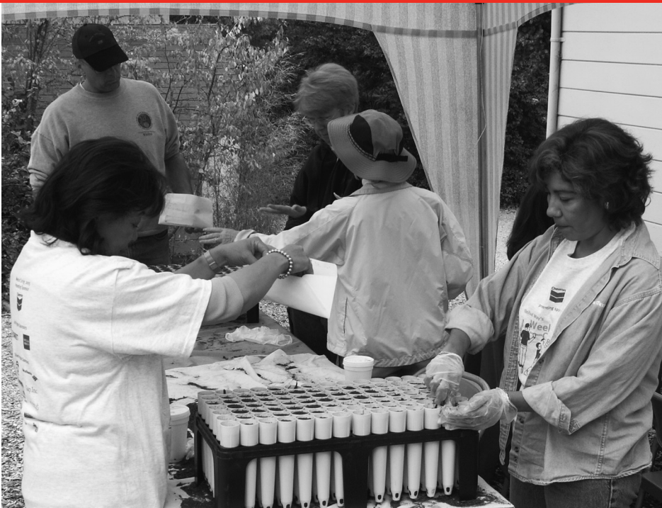
Chevron employees prepare seedlings for planting at the Walnut Creek Open Space project.