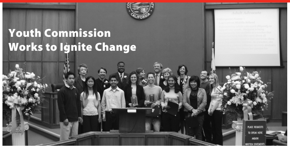
Youth Hall of Fame winners, Countywide Youth Commission members and Board of Supervisors of Contra Costa County

The Contra Costa Countywide Youth Commission (CYC) invites interested teens to serve on their advisory committee for the coming year.