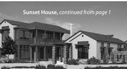
Sunset House, continued from page 1

the 450 non-profit agencies that we support but for this venture we need volunteers who are willing to donate a few hours to help us staff the Idea House."